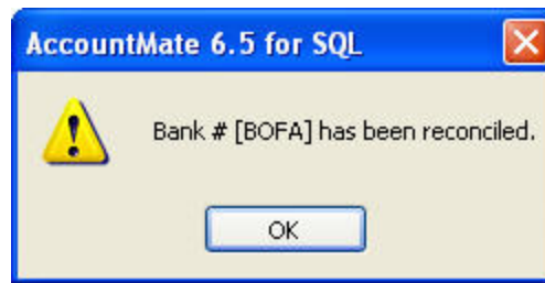
Figure 2-1 AM6.5a Reconcile Bank Account Save message window